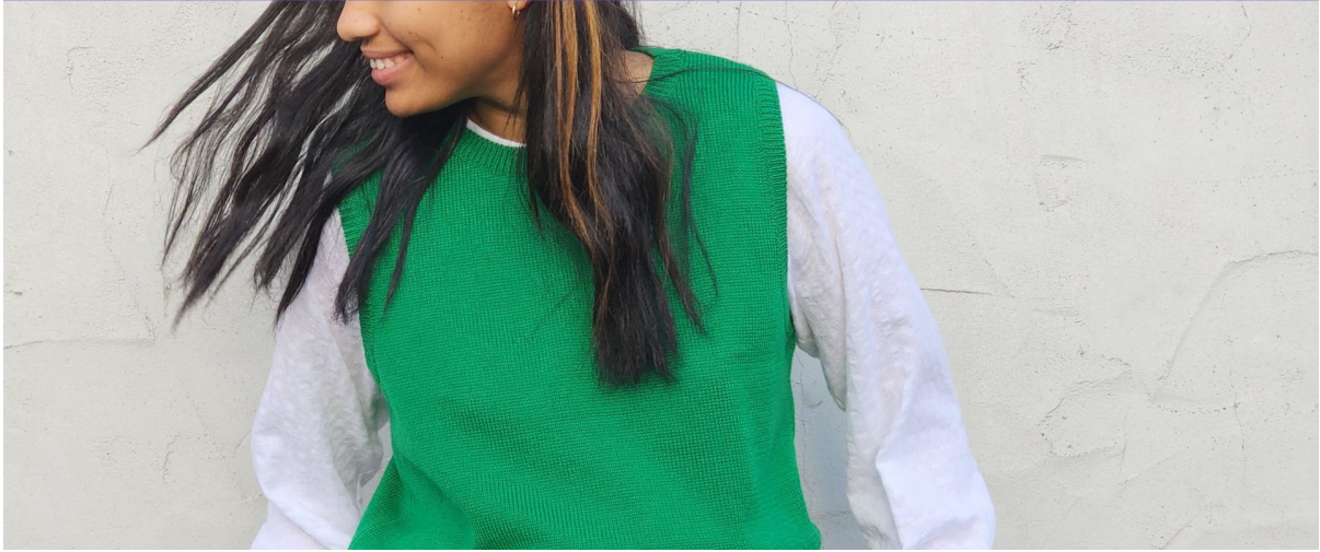
Image: Knitwear from MFNZ member Dalston, produced by MFNZ member Beverley Productions.