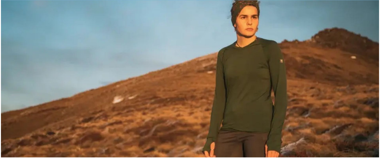
Image: Edmund Hillary