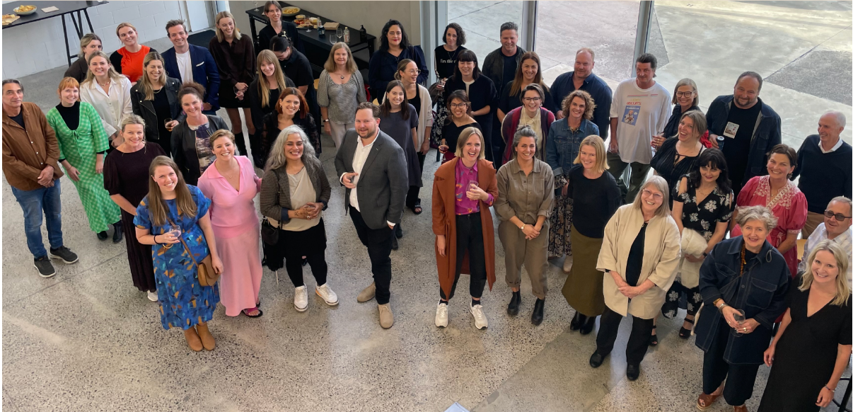
Image: MFNZ Christmas Get-together